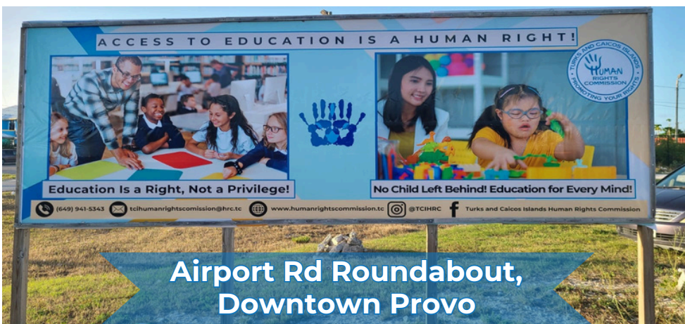
Airport Rd Roundabout, Downtown Provo

This initiative is part of TCIHRC's broader effort to foster a culture of respect, equality, and inclusion by promoting awareness of the CRC. The commission looks forward to expanding the training to all public secondary schools and continuing its work toward a future where every child's rights are fully understood and upheld.